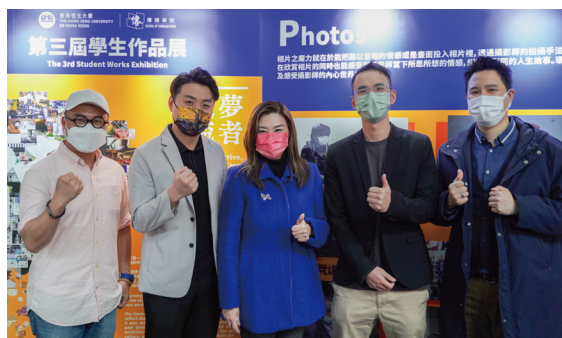
The 3rd School of Communication Students Works Exhibition (2022) 傳播學院第三屆學生作品展 (2022)