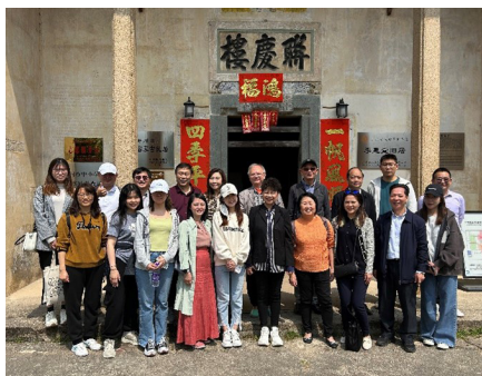
Study Tour on Hakka Cultural Heritage (2023) 客家文化傳承與發展交流團 (2023)