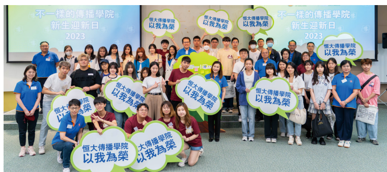
New Student Orientation 2023/24 of School of Communication 傳播學院新生迎新2023/24