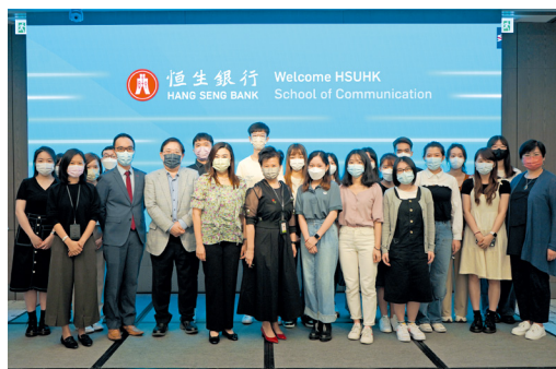
Teachers and Students visiting Hong Kong Hang Seng Bank Central Headquarters (2022) 傳播學院師生參訪香港恒生銀行中環總行 (2022)