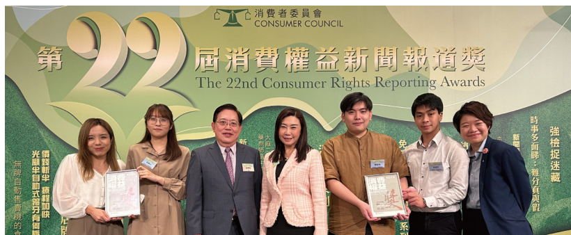
SCOM Students Won Two Awards at the 22nd Consumer Rights Reporting Awards (2022) 傳播學院同學榮獲第22屆「消費權益新聞報道獎」兩個獎項 (2022)