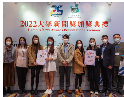
Students garnered a number of awards in China Daily Hong Kong's 2022 Campus Newspaper Awards 同學於中國日報舉辦的「2022 大學新聞獎」獲得多個大獎