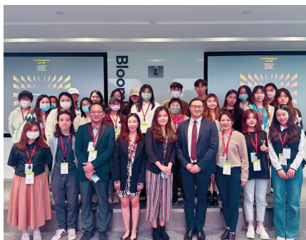
Teachers and Students visiting Bloomberg (2023) 傳播學院師生參訪彭博通訊社 (2023)