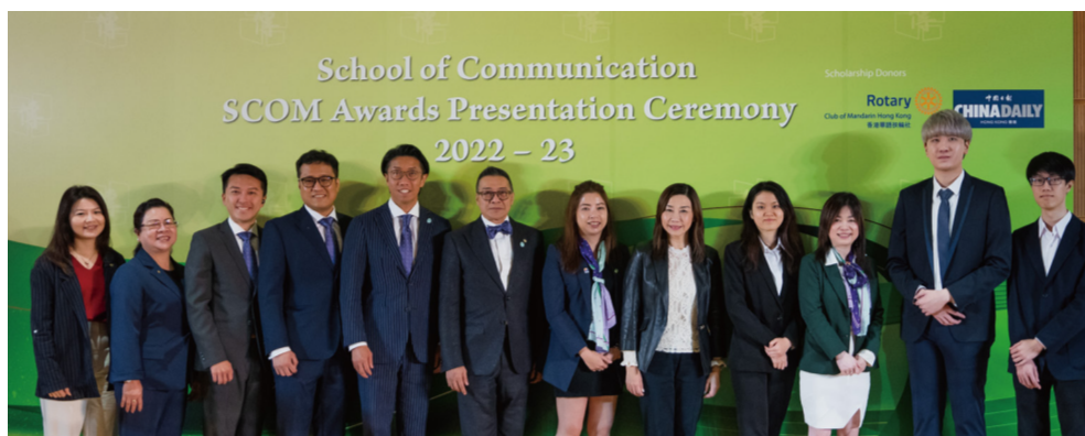
SCOM Awards Presentation Ceremony 2022-23 傳播學院學業成就獎頒獎典禮2022-23